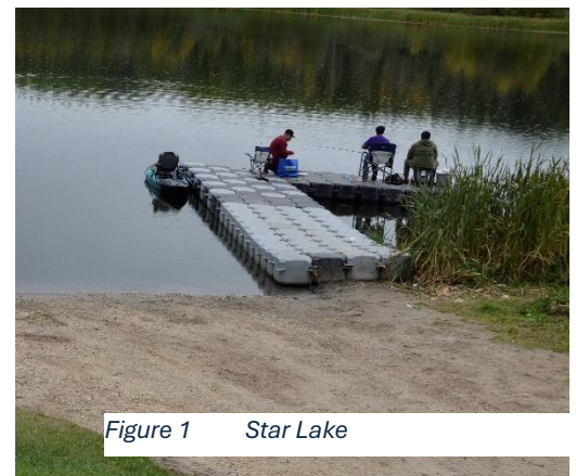
Figure 1 Star Lake

Dolberg Sept. 24 – 3 of us met up there about 11:00am and fished till about 4:30. Fish were rising to a floating backswimmer the whole time we were there. Must have caught 30 or 40 each and they were strong, healthy fish. (cast too near the lily pads, however, and you'll hook up with plenty of perch!)