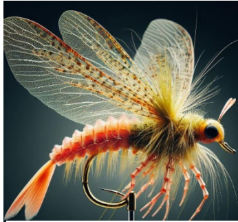
THE FLYING SCUD

On April Fools' Day ... believe nothing you hear! However, here's a well-kept secret known only to long-time members of ETFC: Spring Lake has a rare population of flying scuds, freshwater shrimp that fly in swarms on moonlight April nights! If you're tying an imitation, make sure the wings are translucent – trout are selective and prefer them that way.